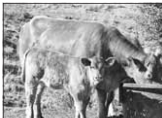
Midas Opal E0009