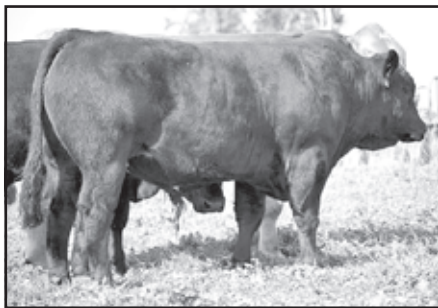
Producing and Selling Black Sires Like “E.L. Coaltrain C23”

Selling at The 2009 National 7 Bulls and 6 Females Bulls, Females, Embryos and Semen For Sale at All Times