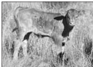
Midas E015 born 18.07.09