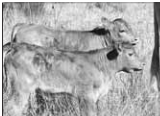
Front: Midas E019