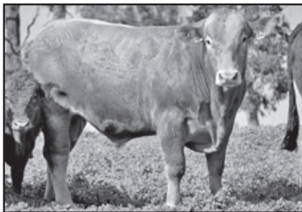
Long, Smooth and Heavily Muscled like “E.L. Classic C56”

Make sure you don't miss our selection of elite imported genetics in our female offering. 2010 will be 20 years of leading the way with Gelbvieh. Watch out for our monthly specials next year.